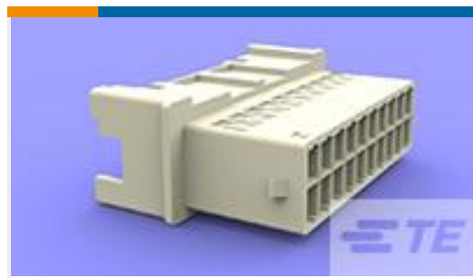
TE Part # 2-1969592-4 HSG,REC,FREE-HANGING,DUALROW,EP2.5