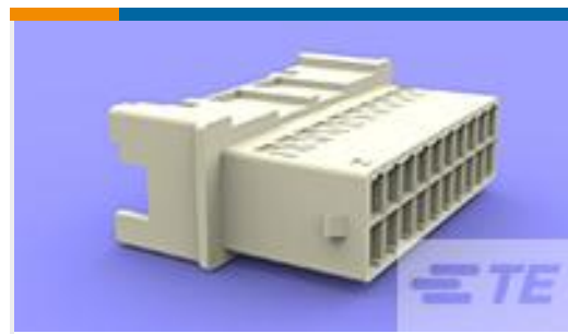
TE Part # 2-1969592-6 HSG,REC,FREE-HANGING,DUALROW,EP2.5